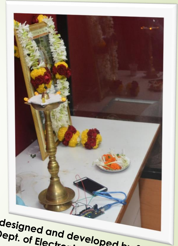
E-Diya designed and developed by Students of Dept. of Electronics, KTHM, Nashik