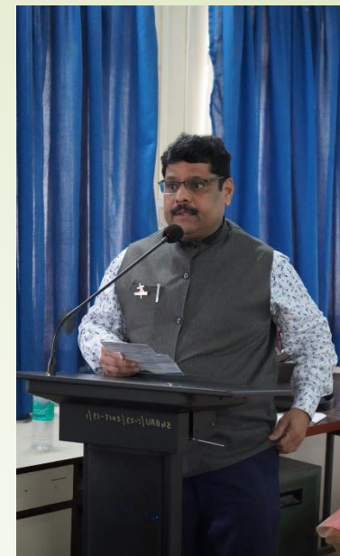
Inaugural address by Pro-VC, SGBAU