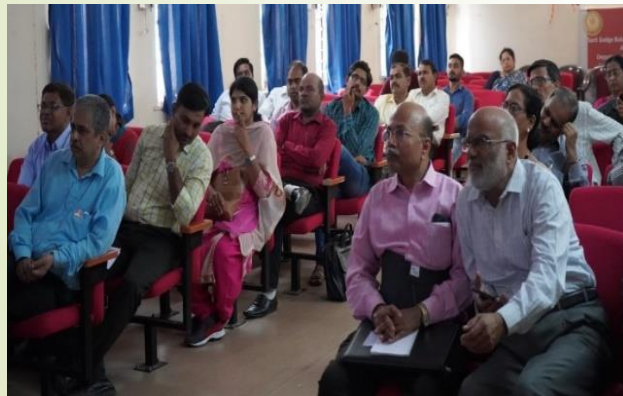
Faculty participants from different academic institutes in and around Amravati