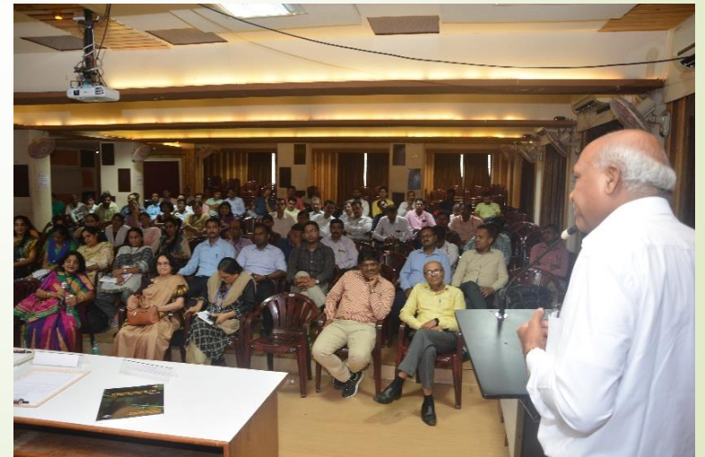
Faculty participants from different academic institutes in and around Nashik