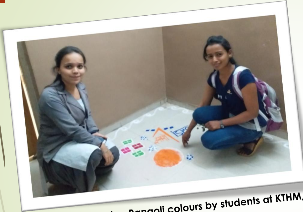
ISRO logo drawn using Rangoli colours by students at KTHM, Nashik