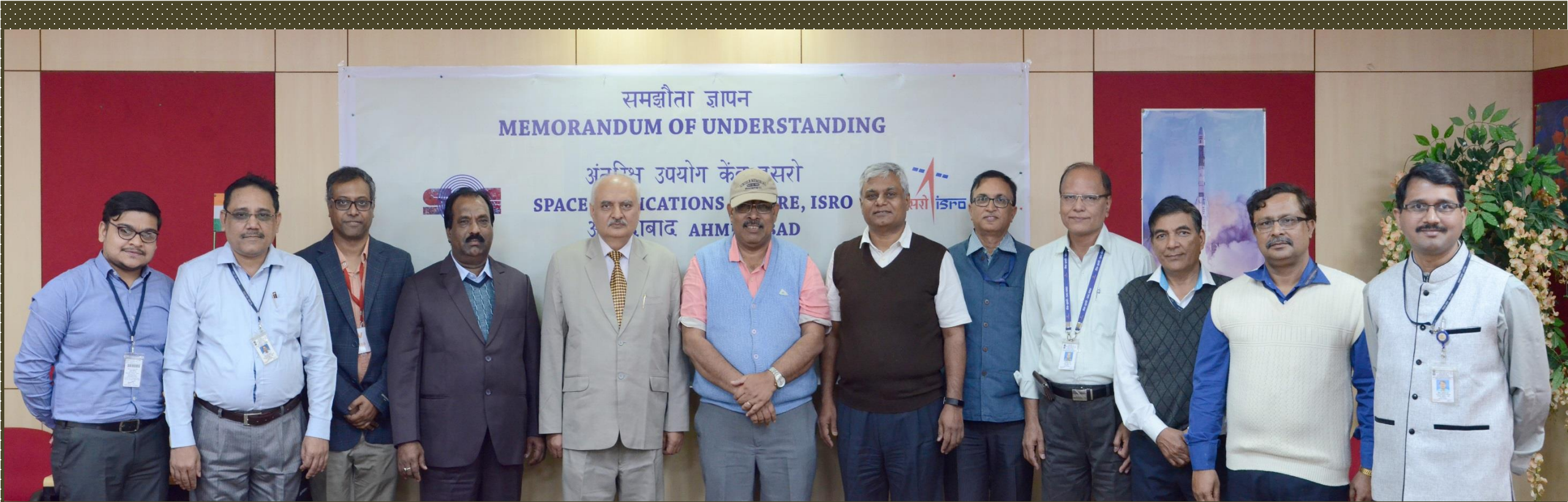
Group Photo of SAC & Dept. of Agriculture Team

Organized by Technology Transfer & Industrial Interface Division (TTID /PPG )