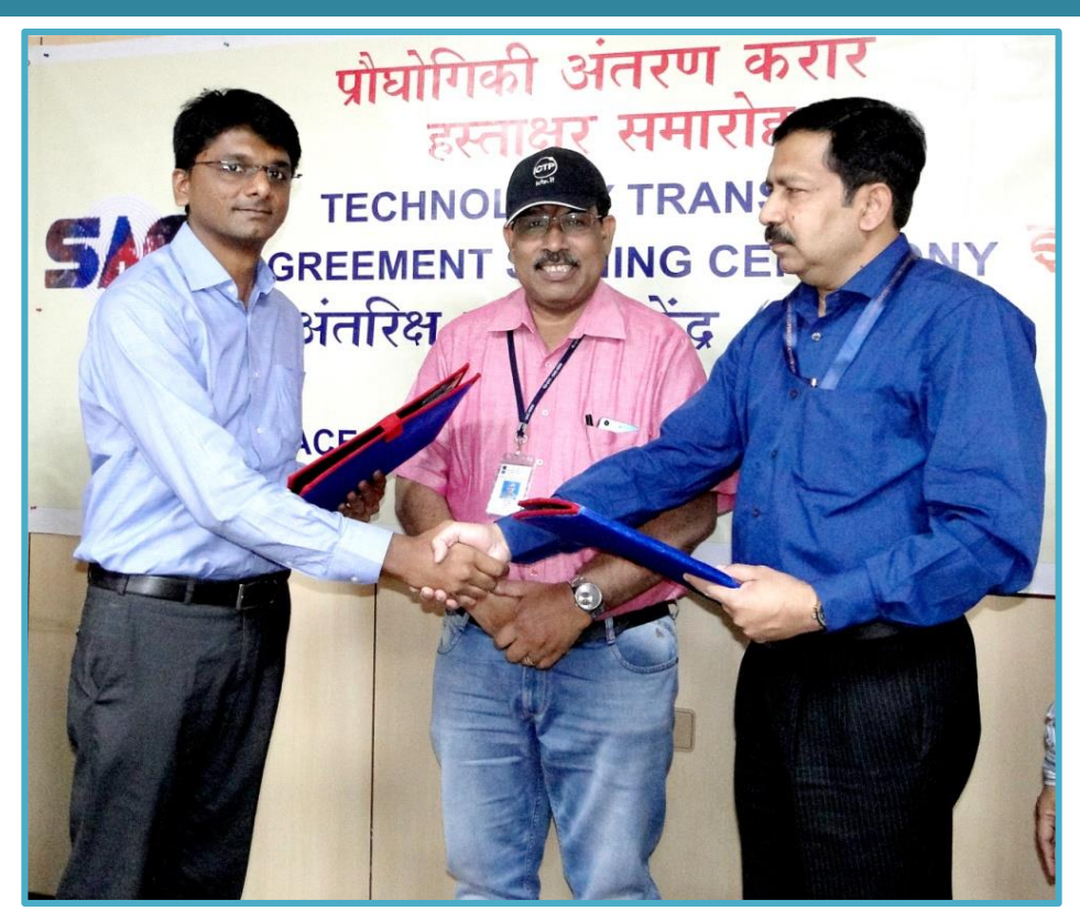
24th March, 2017