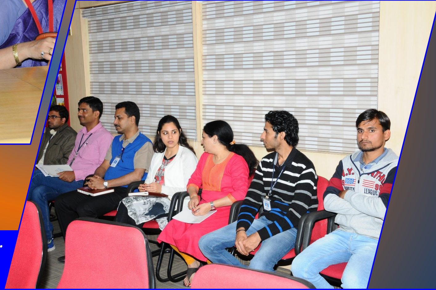
SAC Tracking Receiver Team.